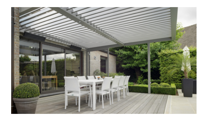
Consumer I conservatories, carports, canopies, and verandas.