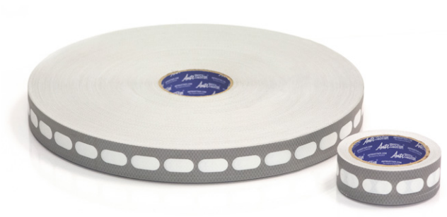
Available from 6.5 meters to 300 meters