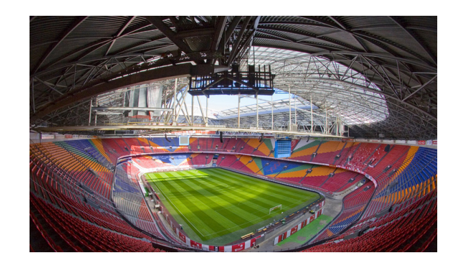
Utilities I stadiums, hospitals, train stations, airports, swimming pools and commercial centres.

The original AntiDUST® tape by Multifoil is the no.1 tape system for the polycarbonate multiwall market. For more than 30 years AntiDUST® tape by Multifoil is the standard in many projects all over the world.